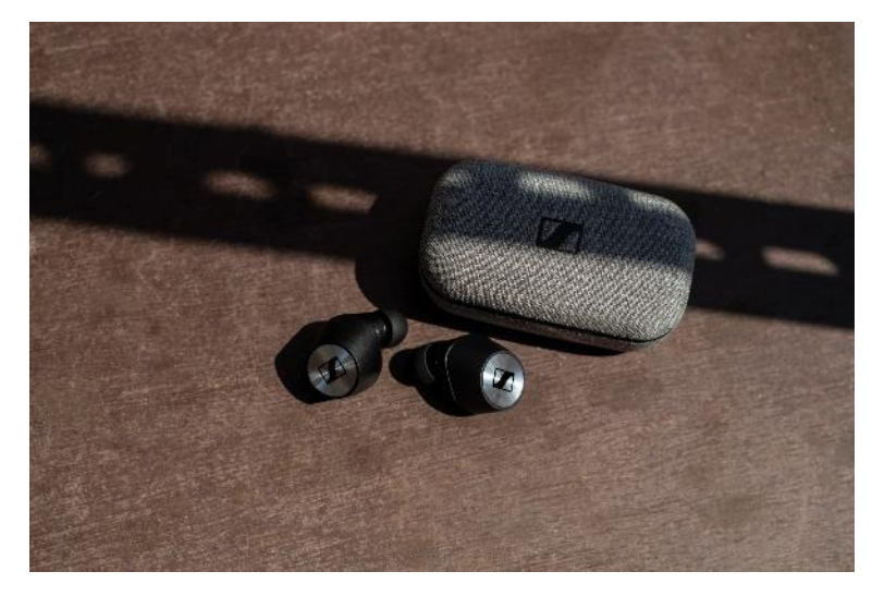
Sennheiser's new MOMENTUM True Wireless earphones set new standards for audio quality, with characteristic MOMENTUM style and comfort.

The first model in a new generation of the iconic MOMENTUM family redefines the audio benchmark for true wireless earphones with superior stereo sound performance that is guaranteed by Sennheiser's audiophile 7mm dynamic drivers. With the latest Bluetooth technology, AAC codec support, and Qualcomm® aptX<sup>TM</sup> compatibility, this exceptional hi-fi sound is delivered without any compromise. "The MOMENTUM range has always stood for a fusion of excellent sound, progressive technology and craftsmanship. We are pleased to now introduce the newest member of the family, which brings the essence of MOMENTUM to a truly wireless form for the first time", said Frank Foppe, Product Manager at Sennheiser.